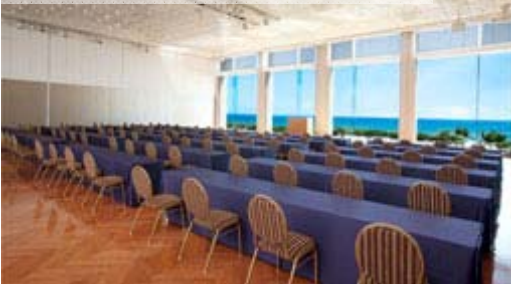
Venue: Kamakura Prince Hotel **