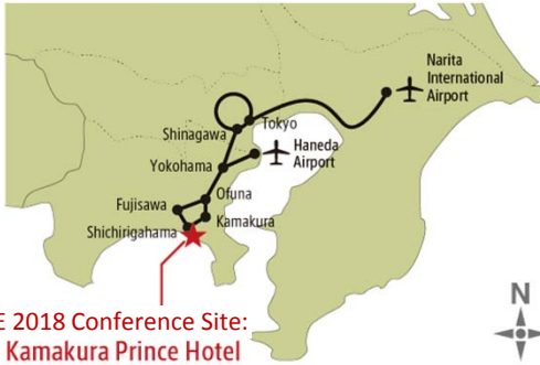
ICPE 2018 Conference Site: Kamakura Prince Hotel