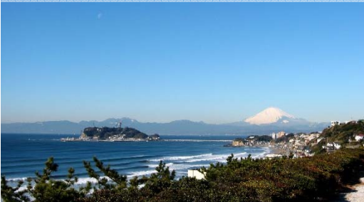
Venue: Kamakura Prince Hotel